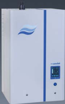
Condair EL electric steam humidification

Alongside this comprehensive range of humidifiers, Condair has the experience to deliver the right solution for any heritage application and support customers in the field with specialist engineering services.