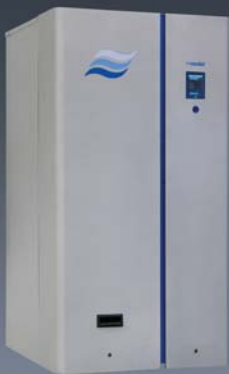
Condair GS gas-fired steam humidification