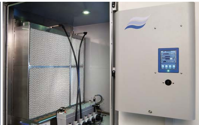
Condair ME evaporative humidification