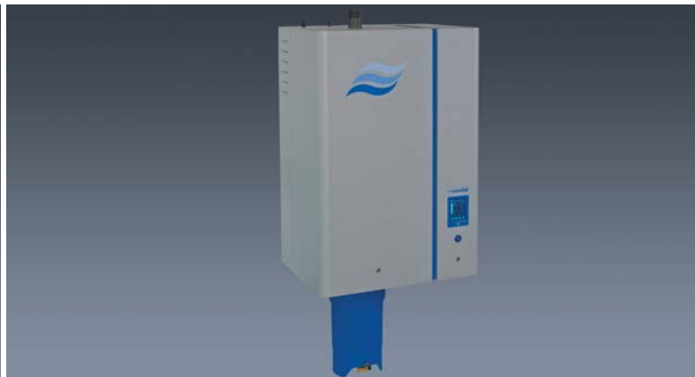
Electric steam humidification