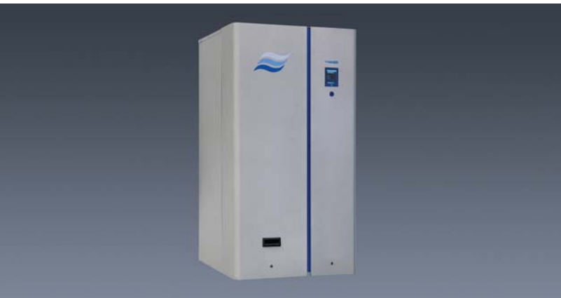
Gas-fired steam humidification