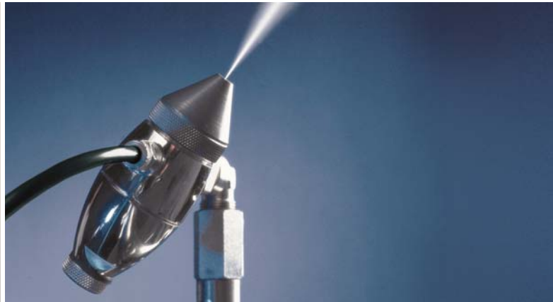
In-duct or direct air spray humidification