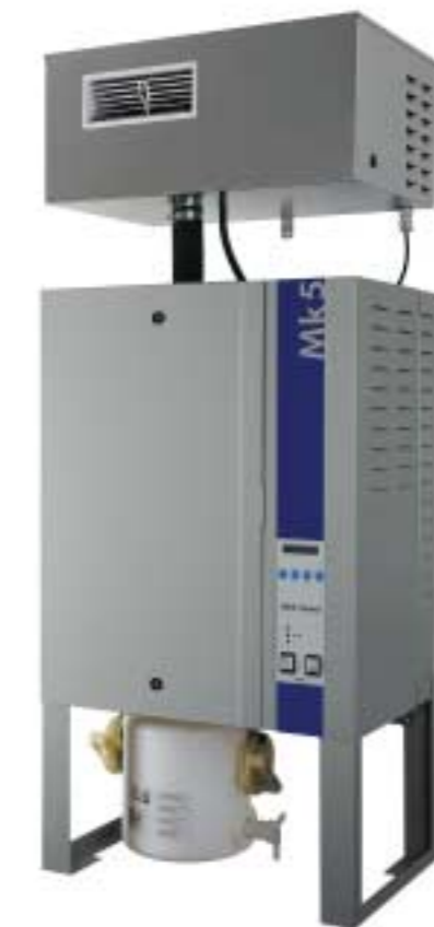
FAN for industrial direct-room humidification