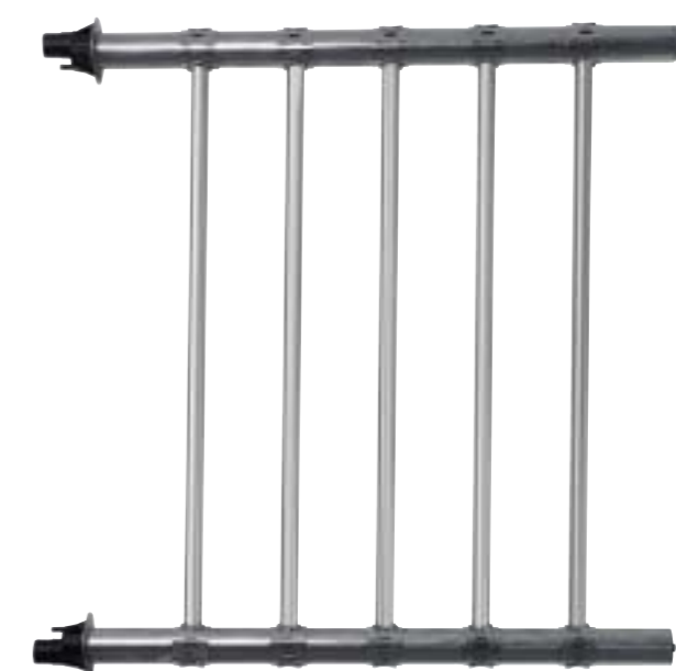
Multi-steam distribution system OptiSorp for very short humidification distances, up to four times shorter than conventional steam distribution pipes.